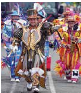
10x10 Upstreet Winter Arts Festival, Let it Shine! Block Party, Juneteenth Celebration, Fourth of July Parade

Visit lovepittsfield.com and downtownpittsfield.com for a daily calendar of all events.