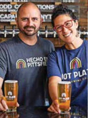
Hot Plate Brewing Co.