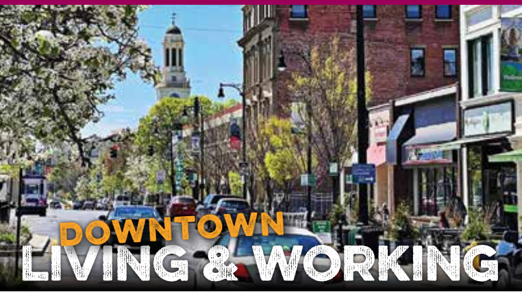
North Street