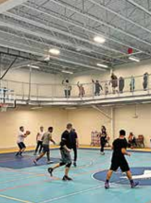
YMCA Basketball and Track