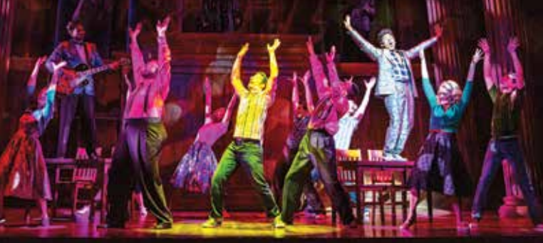
Berkshire Theatre Group's Rock and Roll Man, the Alan Freed Story

Designated one of the Cultural Districts in Massachusetts, Pittsfield's downtown, known as the Upstreet Cultural District, boasts a lively roster of music, dance, theatre, community festivals, and celebrations, including two highly acclaimed professional theatres – the Colonial Theatre, part of Berkshire Theatre Group, and Barrington Stage Company. There's a vibrant visual arts scene in Pittsfield too, with public art, thriving galleries, artist studios and cooperatives, and the First Fridays Artswalk. Cultural festivals include First Fridays at Five, Berkshire Pride, Pittsfield CityJazz Festival, 10x10 Upstreet Arts Festival, and more!