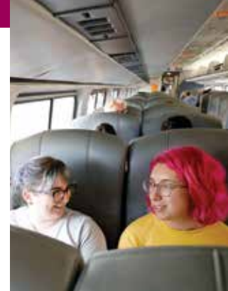
The Berkshire Flyer, credit Stephanie Zollshan/The Berkshire Eagle

cityofpittsfield.org/departments/airport Regional general aviation airport, owned and operated by the City of Pittsfield, offers business and casual travel access to the region via private and chartered aircraft ranging from single engine piston to multi-engine jet. The airport also has a flight instructor at the Fixed Based Operator, Lyon Aviation, and scenic flights available.