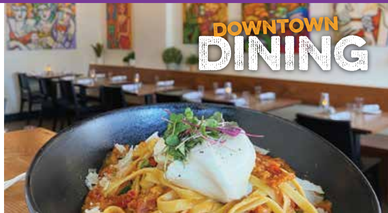
District Kitchen & Bar