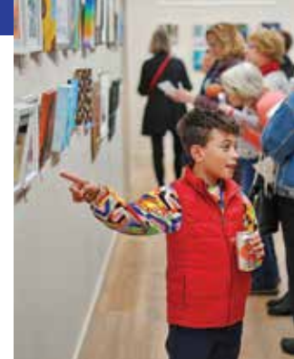
Clock Tower Artists