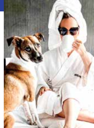
Hotel on North

We're breaking the "yogi" mold with fun and freedom in every flow. You'll love our therapeutic infrared heat, soothing candlelight, and energized community. Try your first 2 weeks for $39! BIG NEWS - We're moving to 744 Williams Street! We'll remain open on North Street until Summer 2024. Check our website for updates.