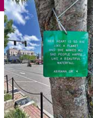
Downtown Has Heart

402 East St. | 413-448-8224 | wheelerandtaylor.com