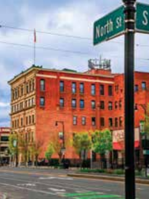
Downtown, credit Good Bites & Glass Pints