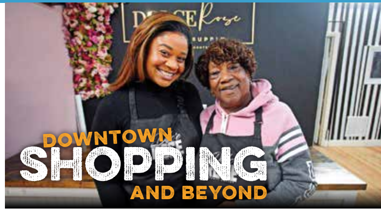
Dolc'e Rose Beauty Supply

34 Depot St. | 413-344-4285 | https://titosmexicangrill.restaurant